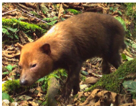
Bush dog, a small 10-12 pound species of wild dog, photos were captured in Fall 2018.

The UNCW Biology department is using remote cameras, purchased with funds from the Friends, to monitor the health of mammals and the forest ecosystem on the east slope of the Andes mountains in Ecuador. Remote cameras were purchased as part of a long-term project to monitor medium to small mammal species diversity at Wildsumaco Biological Station in Ecuador. Remote cameras provide the opportunity to study biodiversity in this region, and students gain hands-on experience using the cameras and analyzing the photos.