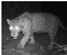
Jaguar photos were captured for the first time in Summer 2018.

These grants are made possible by donors like you!