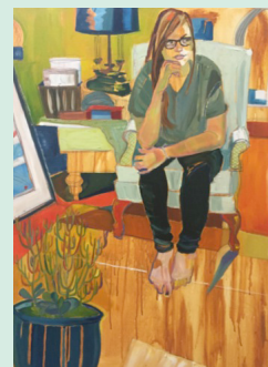
The Conversation, Oil Painting by Loraine Scalamoni

Each year art students at UNCW can participate in the All Student Show exhibit in a formal art gallery on campus. This experience teaches them how to price, market, and